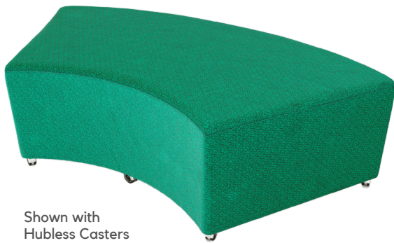
Shown with Hubless Casters