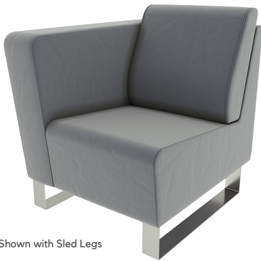
Shown with Sled Legs