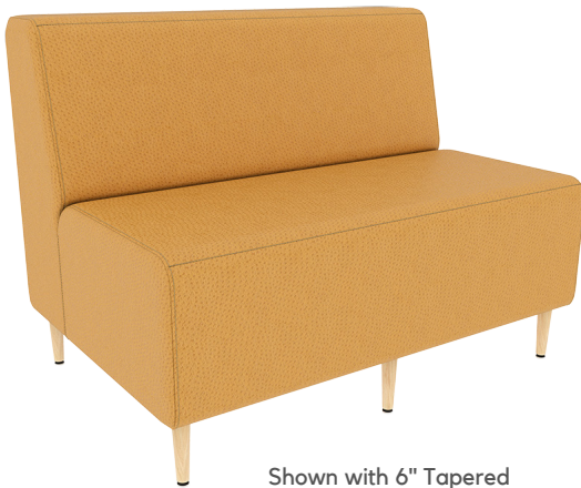
Shown with 6" Tapered Round Natural Wood Leg