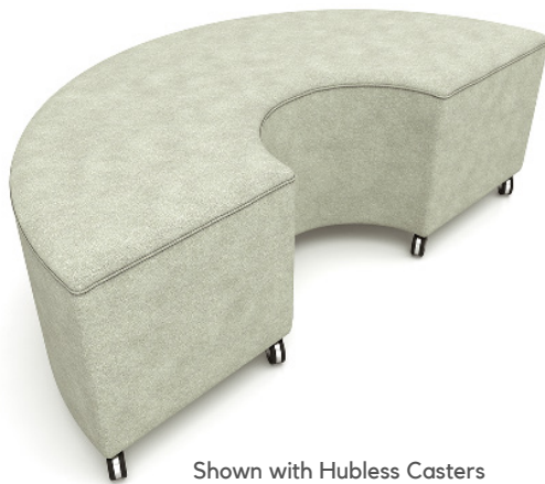
Shown with Hubless Casters