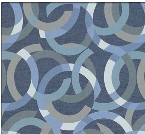
RNT20 Ocean Park