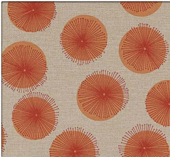
PD052 Wild Fire