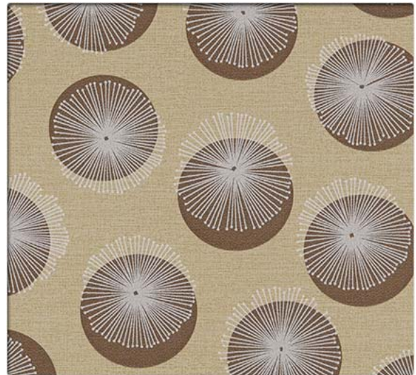
PD053 Sand Dune