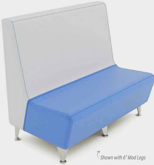
Shown with 6" Mod Legs

Use the Café Booth to create community spaces in libraries, lounges, informal locations, and dining centers. Energize these spaces with booth installations that help connect people and encourage them to develop relationships essential for success.