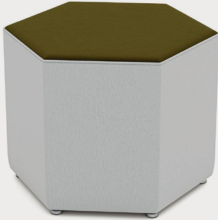
Shown with 1" Nylon Glides

This unique little Honeycomb shape can serve as a single seating space or nest them together to make a Beehive set. These units are light weight enough for the kids to shuffle around and design their own comfortable spaces. Let the kids take control and watch them interact and collaborate to create different designs. This is the perfect seating solution that promotes collaborative and active learning.