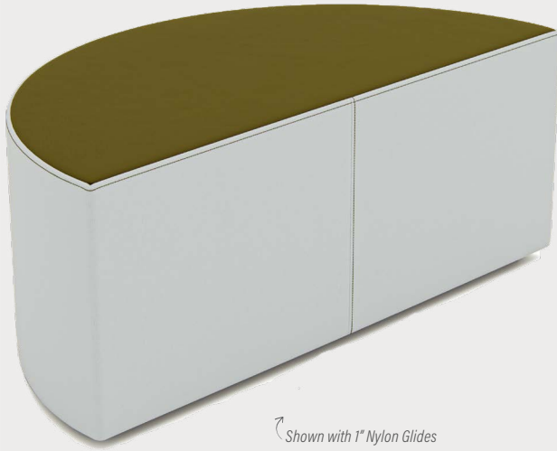
Shown with 1" Nylon Glides

This elegant Half Moon Bench makes for a great accent piece. It goes beyond mere comfort and functionality thanks to its unique design. Use it for lobbies, waiting areas, lounges and just about any gathering space.