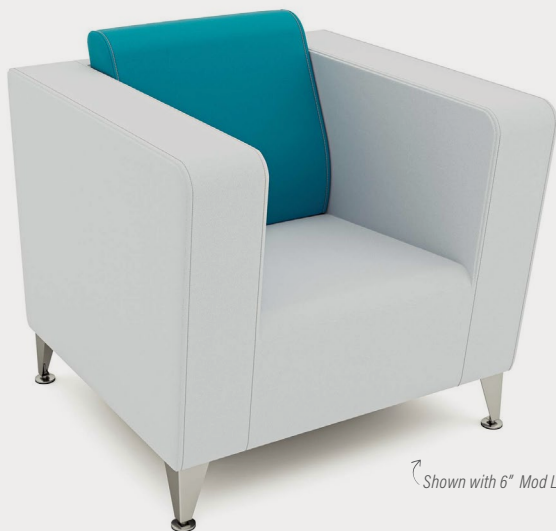
Shown with 6" Mod Legs

Create a welcoming environment for your next space. Featuring comfortable, functional, and creative seating options. The Full Social Chair is a keystone piece all on it's own or create an adaptable seating arrangement using multiple pieces from the Social series.