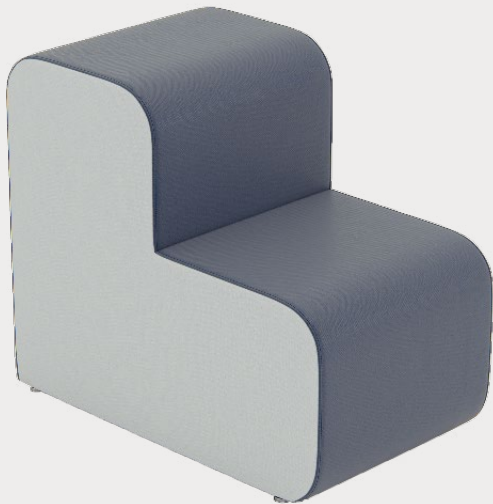
Shown with 1" Nylon Glides

The Bubble Chair stands out with its distinctive, rounded design, offering both comfort and a unique style that transforms any space. Like the rest of our Bubble series, it's crafted from solid foam, making it a lightweight and durable seating option that's easy to move and reposition. Its curved silhouette and ergonomic support provide a comfortable seat for learners of all ages. Whether featured as a standalone statement piece or incorporated into a larger seating area, the Bubble Chair brings a stylish yet functional touch to lobbies, classrooms, and collaborative spaces.