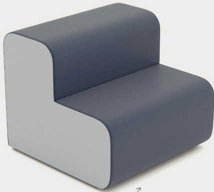
Shown with 1" Nylon Glides

The Bubble Two Step brings a fresh twist to our classic Step Series. Featuring rounded edges, this piece blends eye-catching design with ergonomic support, making it a standout seat in any space. Our steps are crafted from solid foam, making them lightweight and easy to move. The absence of hard edges ensures safety for learners of all ages, while the versatile design allows for collaborative seating arrangements. Combine it with other pieces from the Bubble Step Series to create flexible seating solutions perfect for lobbies, common spaces, media centers, the spaces in between, and more.