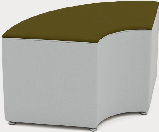
Shown with 1" Nylon Glides

Take your seating arrangement a step further with the ¼ Round Ottoman. Its dramatic arced shape perfectly complements other ottomans in our FOM COLLECTION. Use it a stand-alone piece or in combination with other ¼ or ½ Round Ottomans.