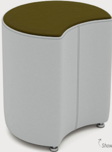
Shown with 1" Nylon Glides

The crescent shape of this ottoman is a conversation starter. If you're looking for a simple way to add extra seating and character to a room without sacrificing design, this is a piece you can't ignore. Relax into it as a footstool or a seat.